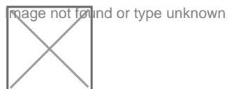
Table Description automatically generated