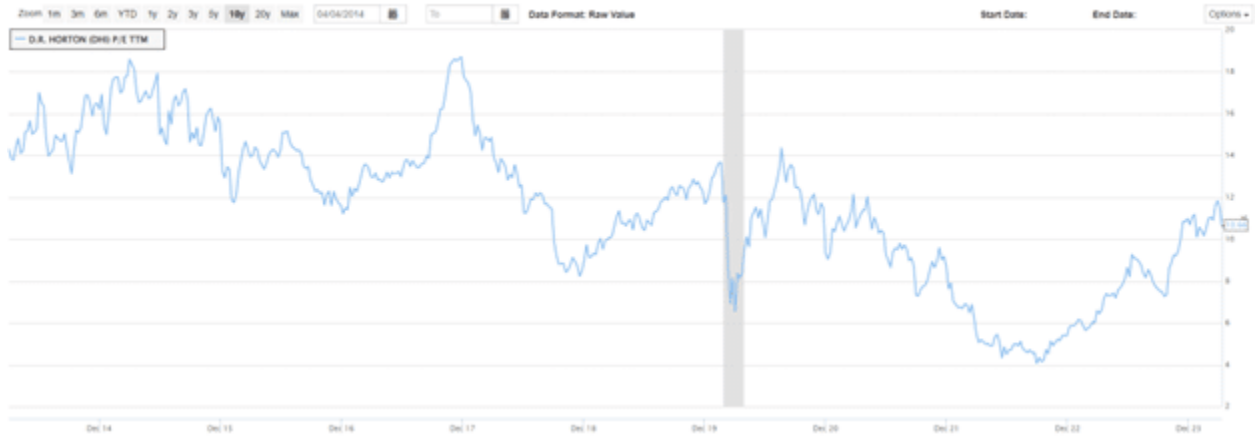
D.R. HORTON (DHI): PE Price to Earnings Ratio Chart

DHI has a moderate PEG ratio of 1.94 and a Debt-to-Equity ratio of 23.3%, which aligns with other major competitors.