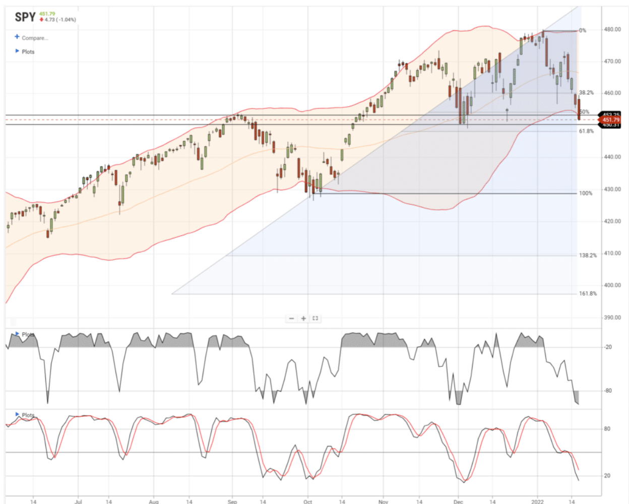
Chart Courtesy of SimpleVisor.com

While the market selloff has been fairly brutal, it has not violated support at the December lows, nor the uptrend. Therefore, be careful making emotionally driven changes to portfolios. Look for a counter-trend rally back to the 50-dma to start rebalancing risk and raising cash levels.